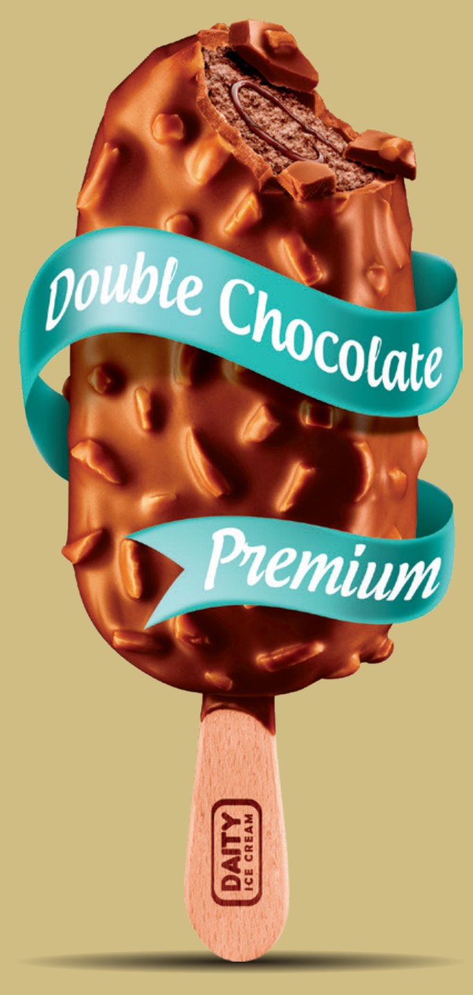
Double Chocolate Premium Ice cream